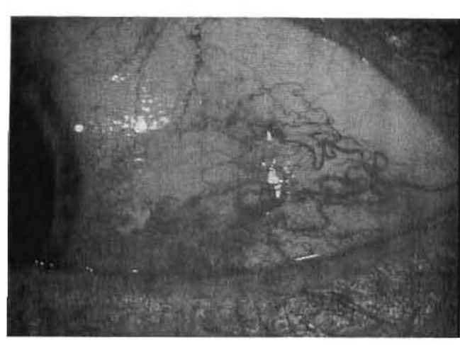
FIG. 1. Slitlamp view of the left temporal bulbar conjunctiva showing vascular tortuosity with overlying focal area (milky white) of conjunctival epithelial loss. Fluorescein staining (not shown) of this area was present.

opposition and subsequently fibrose together. The most likely mechanism is secretion of the drug in the tear film, with direct toxic contact of the ocular surface and canalicular system. Docetaxel has been detected in tear samples immediately following intravenous infusion; however, formal pharmokinetic studies have not been performed. It is unclear if the polychromatic lenticular changes are the result of docetaxel therapy; however, the subcapsular location of the changes may indicate recent formation. A prospective study to evaluate the effect of dosing regimen with respect to ocular toxicity is underway at the University of Texas, M.D. Anderson Cancer Center, Houston, Texas.